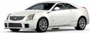
WHITE DIAMOND TRICOAT 1